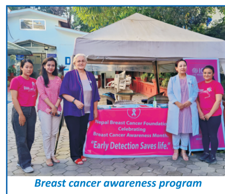
Breast cancer awareness program

IOM Nepal and the Government of Nepal signed the Cooperation Agreement in 2007, since then IOM has been conducting health assessment of outbound refugees as well as Nepali migrants through its Migration Health Assessment Centers (MHACs) located in Kathmandu and in Damak. A total of 49,645 clients and 179 refugees have received health assessment and screened services. A considerable number of awareness programmes and screenings were conducted on World Health Day , International No Smoking Day , and mobile based clinical health services as well. Similarly, the month of October was celebrated to raise awareness about breast cancer, and screening services were provided to 54 UN agencies staff members and dependents. Similarly, equipment has been donated to the District Health Office Kathmandu to strengthen public health capacity.