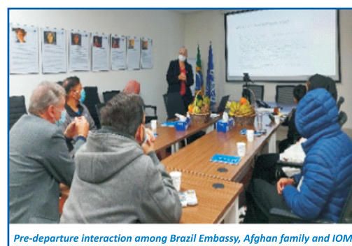
Pre-departure interaction among Brazil Embassy, Afghan family and IOM

IOM Nepal has been assisting in the resettlement of refugees since 2007, the overall assistance of IOM in Nepal regarding the resettlement of refugees, primarily Bhutanese refugees but also refugees from other countries requiring international protection and accepted for resettlement. A total of 2,397 individuals including refugees, migrants and very vulnerable third country nationals requiring protection and cases of family reunion have received assistance for resettlement in various countries.