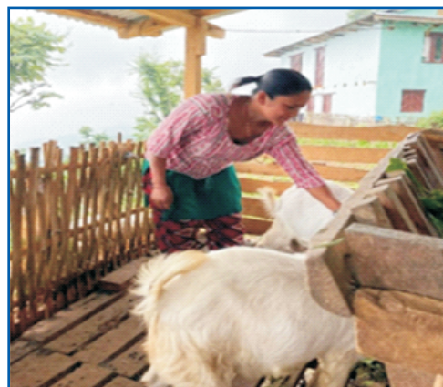
Women returnee migrant engaged in business

In coordination with the Ministry of Labour, Employment, and Social Security (MoLESS), IOM organized a multi-stakeholder consultation with a whole-of-government and whole-of-society approach to discussing the Global Compact on Safe, Orderly and Regular Migration and the draft National Implementation Strategy for GCM . IOM supported the Government of Nepal in the development of the National Framework which will provide a comprehensive policy guide in addressing some of the most pressing issues around migration. IOM supported developing the migration profiles