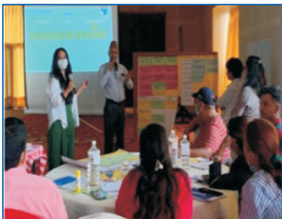
IRIS training in Dhangadi, Sudurpaschim Province

IOM Nepal's is managing the School on Migration Studies (SMS) in cooperation with the Ministry of Labour, Employment and Social Security (MoLESS) to enhance the knowledge base on migration, governance, and sustainable development, as well as capacity-building in Nepal. The summer school concept, initiated by Tribhuvan University's Department of Population Studies (CDPS), has reached significant milestones, including the completion of school room refurbishment and the development and launch of a website for the call for applications. The lessons are set to begin in August 2023.