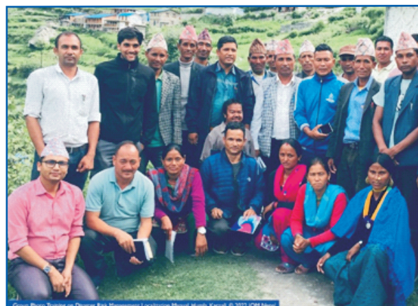
Group Photo, Training on Disaster Risk Management Localities: Mahabub, Munda, Karnali

( D R R M ) operational training manual was developed and rolled out the capacity building training to all 753 local levels and the training program was implemented with the consortium of National Society for Earthquake Technology (NSET) – Nepal, Practical Action Consulting (PAC) and Lutheran World Federation (LWF) Nepal. Developed master trainers at Provincial level and mobilized at local level capacity building on DRRM.