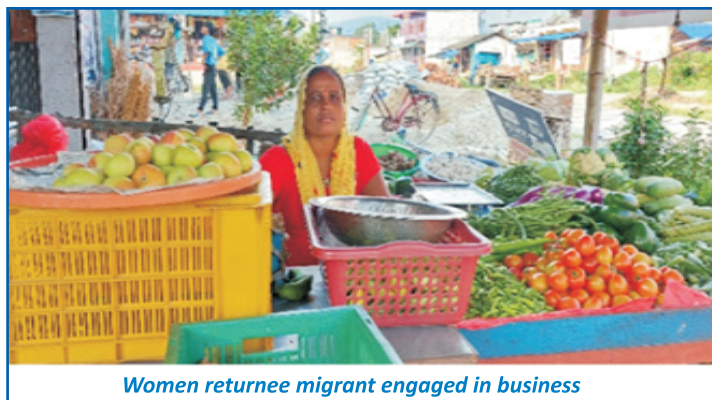
Women returnee migrant engaged in business

and potential of the Nepali diaspora for national development. Multi-stakeholder consultations with the Ministry of Labour, Employment, and Social Security on the Global Compact on Safe, Orderly, and Regular Migration and the draft National Implementation Strategy for GCM adopt a whole-of-government and whole-of-society approach, ensuring inclusive discussions. Additionally, IOM organized 10 consultations on migration and sustainable development and conduct four trainings on an integrated approach to reintegration, providing training to government officials, Civil Society Organizations (CSOs), Migration Resource Centers (MRCs), and Migration Resource Desks (MRDs).