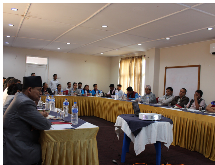
Consultation in Progress, Karnali Province